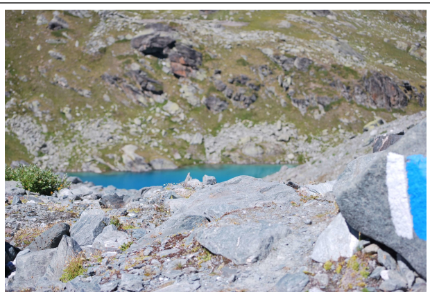
Blue and white signage so you don't get lost

The path is marked with blue and white signs . It is difficult to get lost. You can see below, one of the many azure blue water lakes. Just this view makes you want to go there, doesn't it? I warmly recommend it to you, it is a real eye-opener.