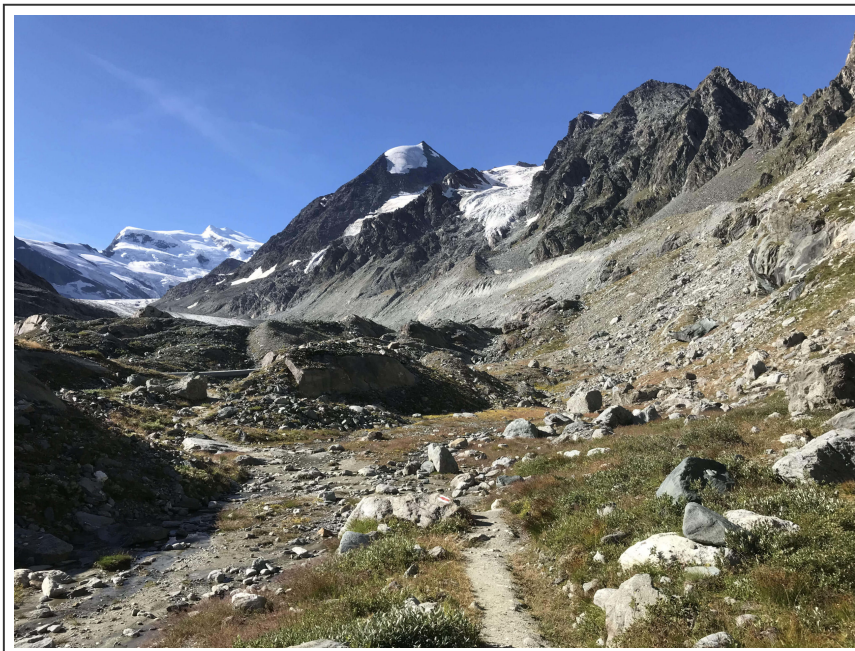
The path is well signposted

There is nothing technically difficult about the trail. The path is very well marked. After a few bends, we arrive at the point called " 2140m ". It is necessary to stay on the widest path, to follow the rocky wall, to pass some bumps to arrive at the first interesting point of the route, the footbridge of the Corbassière glacier.