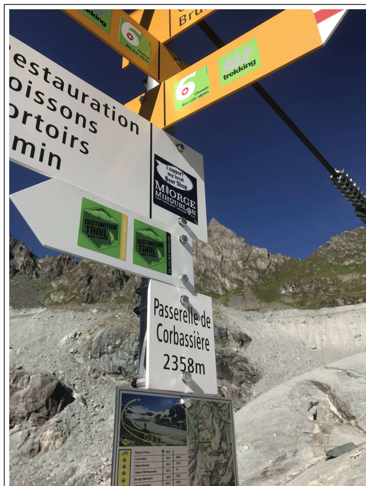
Mandatory passage for this hike

The footbridge is 190 meters long. You don't have to be afraid of heights to cross it. It is without risk.