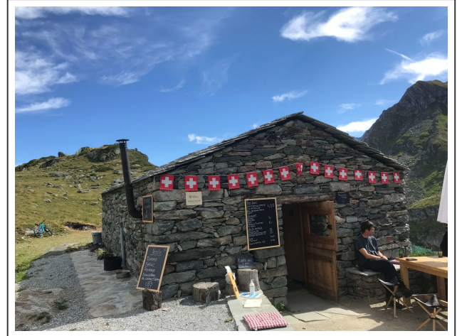
The Sery-Laly's hut

We start the hike on a nice road. After a good hour of walking, we arrive at the first refreshment point, the chalet of Sery-Laly . Once past the alpine pasture chalet, which also offers some welcome drinks to catch your breath, nature becomes really wild and we start the surprising ascent in a slightly arid scree. The sun hits really hard on these rocks. The hat is de rigueur.