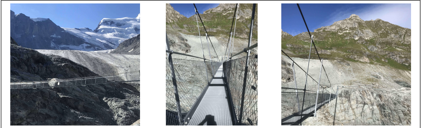
The Corbassière's footbridge, 190m long