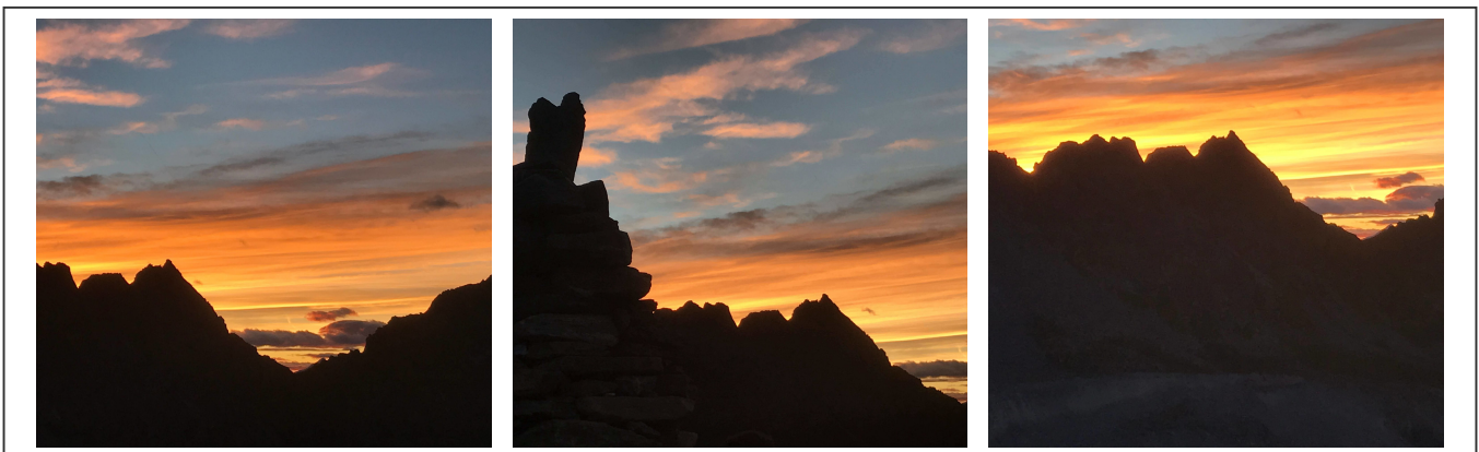
Magnificent view on the glacier of the Grand Combin and sunset to end this second day