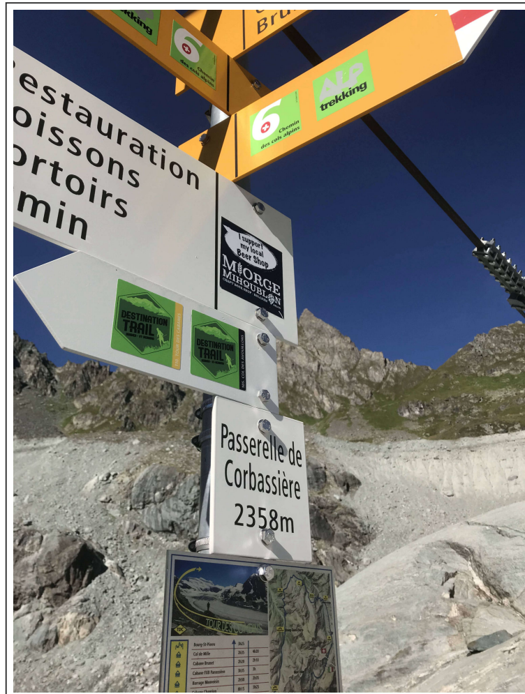
Mandatory passage for this hike

The footbridge is 190 meters long. You don't have to be afraid of heights to cross it. It is without risk.