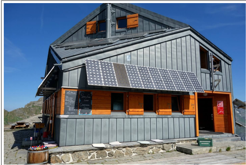
The Panossière's hut

Take the footbridge, then turn left. The path leads to a moraine that you will have to cross to get to Panossière's hut . The hut is located at 2641m . It offers food and lodging. A beautiful common room serves as a meeting point where you can find food and drink. There is also a reading corner with many books available.