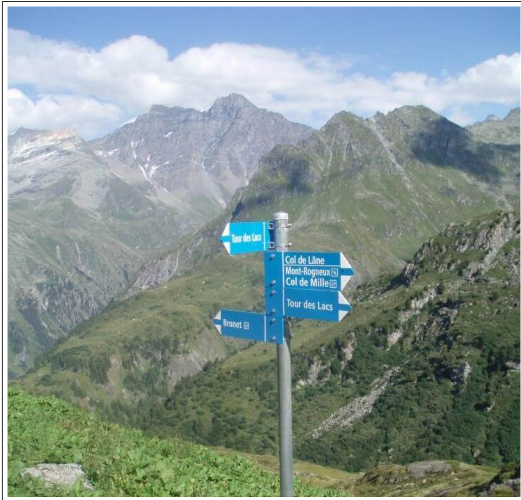
Direction signs to the Lâne pass