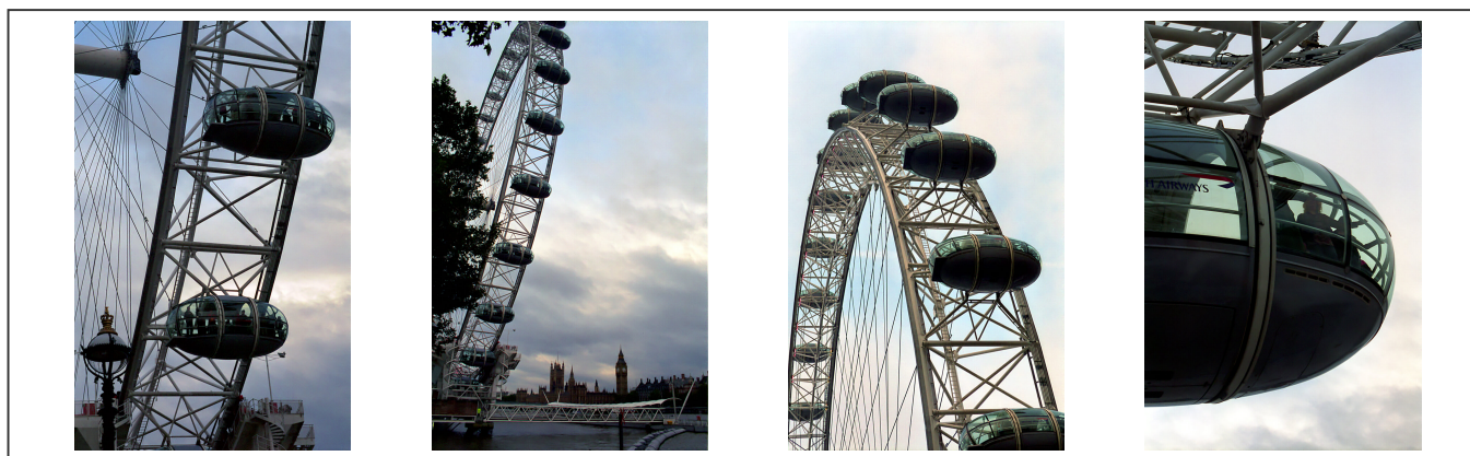
London's “Big Eye”

London's Big Eye was opened to the public in 2000. It is built on the south bank of the Thames and allows tourists to have a great view of the city.