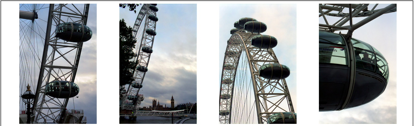
London's “Big Eye”

London's Big Eye was opened to the public in 2000. It is built on the south bank of the Thames and allows tourists to have a great view of the city.