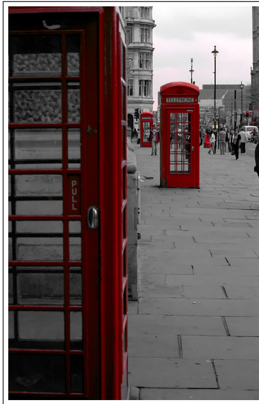
A symbol of England, its famous red phone booths