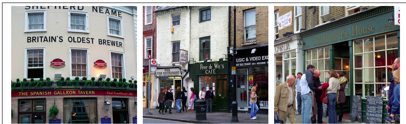
The streets of Greenwich

Greenwich is a town about ten miles, southeast of London. It is known for its maritime history, its location on the meridian of the same name, and its colorful and lively streets.