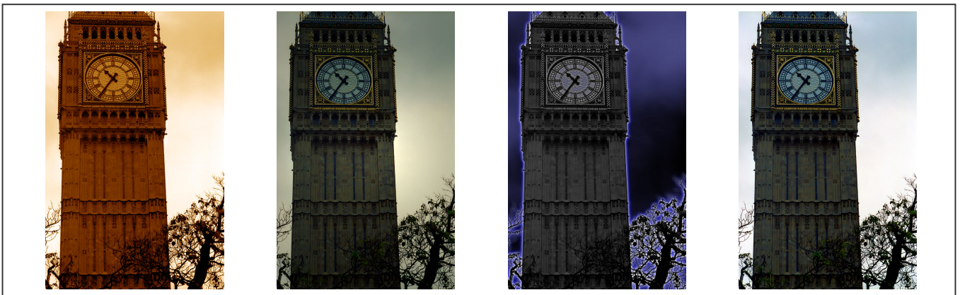
Photographic art on Big Ben

Big Ben is most certainly London’s most famous monument. The clock tower belongs to the Westminster complex. Built in 1859, its main features are its carillon, whose chime is recognizable around the world, and its clock represented on all four sides of the building.