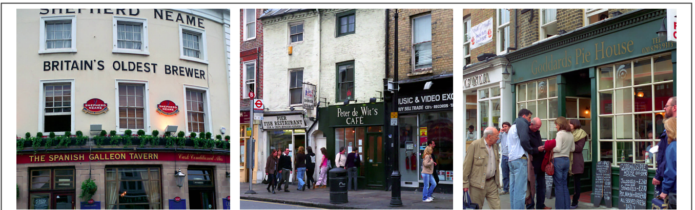
The streets of Greenwich

Greenwich is a town about ten miles, southeast of London. It is known for its maritime history, its location on the meridian of the same name, and its colorful and lively streets.