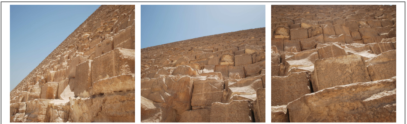
The Cheops pyramid structure