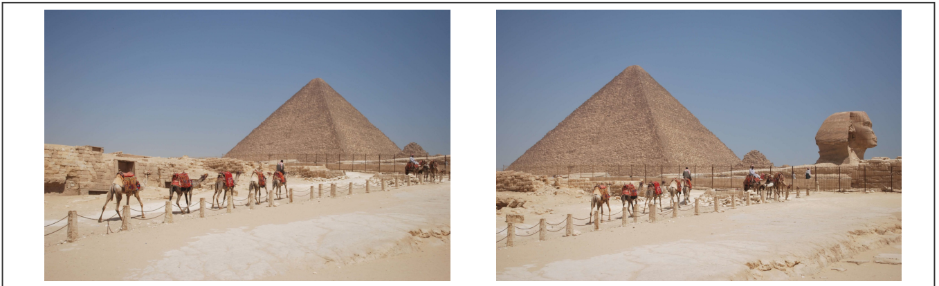
The pyramid of Cheops

The pyramid of Cheops is the largest of them. It is the most majestic, it culminates at 139m.