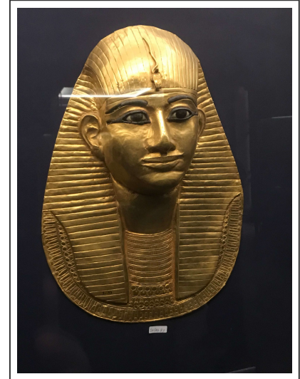
A death mask

But Cairo has much more to offer. Starting with its Egyptian museum and the fabulous sarcophagus of Tutankhamun. Unfortunately, it is forbidden to photograph it. I have chosen other shrouds, less impressive because of their size, but just as elaborate.