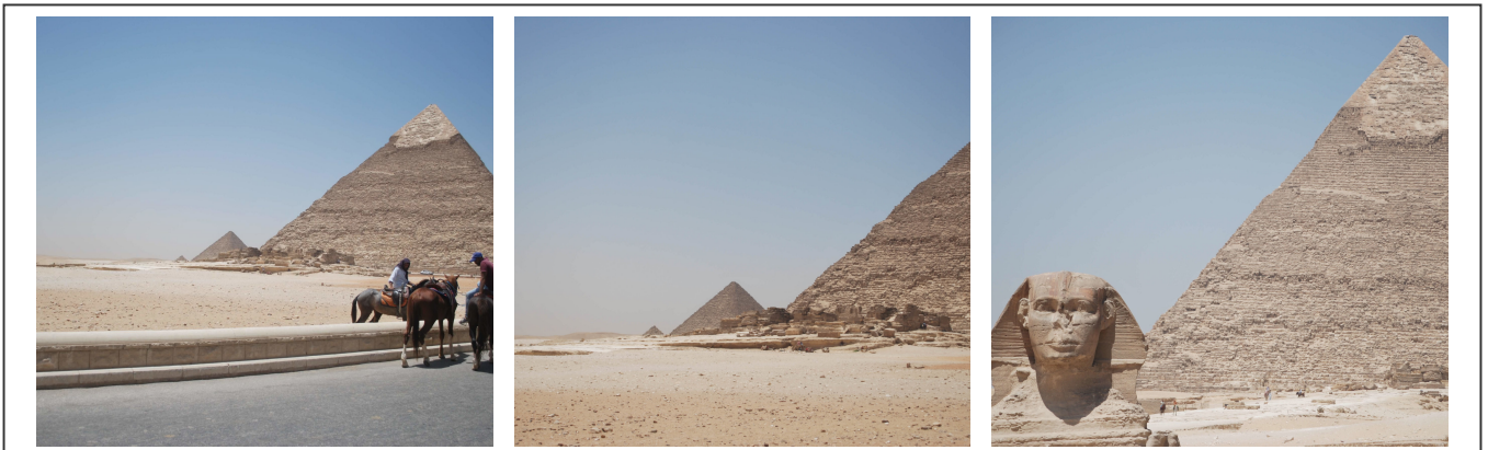
The pyramid of Khephren and its white summit