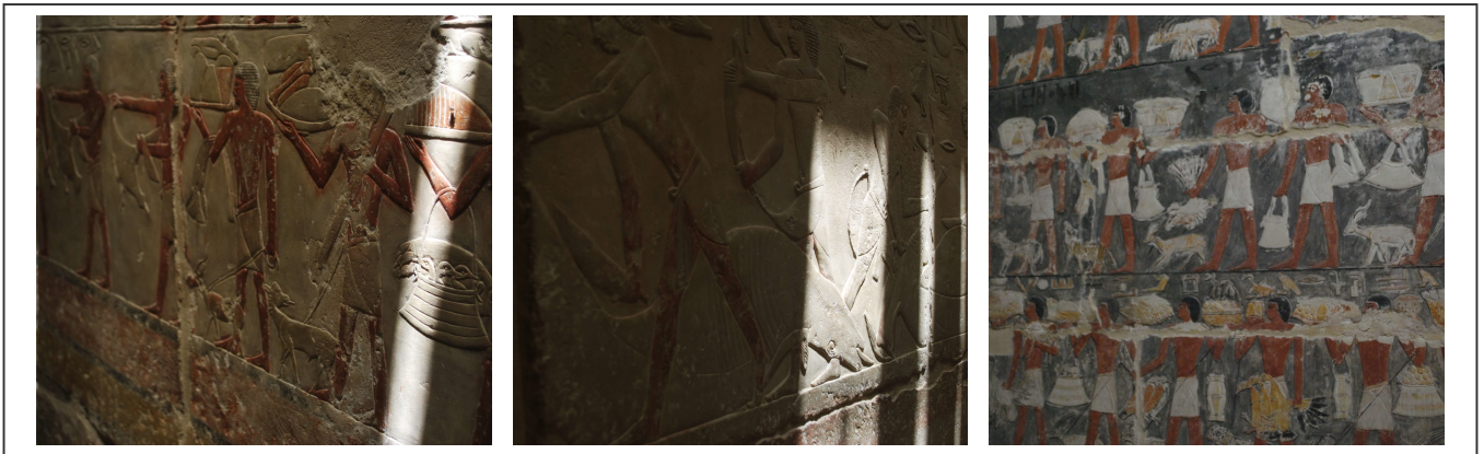
The paintings are relatively well preserved