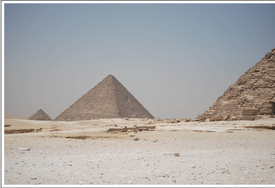
The pyramid of Mykerinos