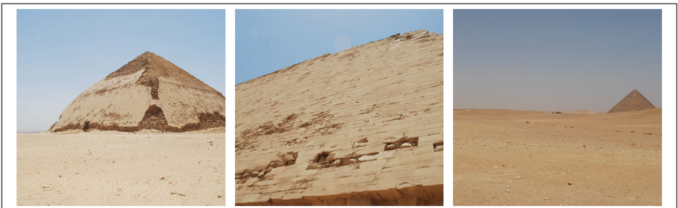
The pyramid of Dahshur

The plateau of Gizèh is not the only place where pyramids can be found. Around Cairo, we can go, still by cab, to the sites of Dahshur and Saqqarah. If the pyramids are much less impressive there, there are also much less tourists. The silence here is very impressive compared to the great plateau.