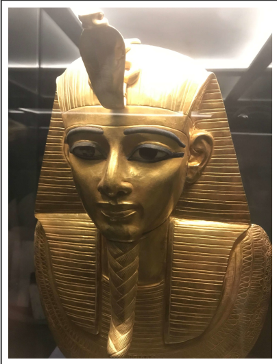
A true golden work of art

But Cairo has much more to offer. Starting with its Egyptian museum and the fabulous sarcophagus of Tutankhamun. Unfortunately, it is forbidden to photograph it. I have chosen other shrouds, less impressive because of their size, but just as elaborate.