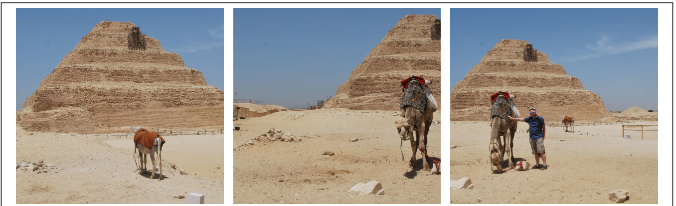
The pyramid of Saqqarah

Another site to visit in the same time is Saqqarah. The pyramid is recognizable by its stepped structure. Archaeologists have recently discovered there new burial chambers decorated and painted with red ochre pigments.