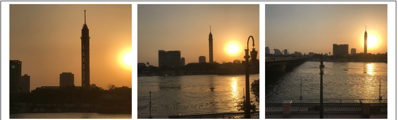
Sunset on Nile river

The Nile flows in the middle of the city center. A stroll along its banks in the evening at sunset is simply refreshing. A moment of pure happiness.