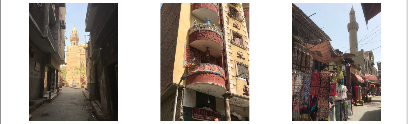
The lively streets of the city center