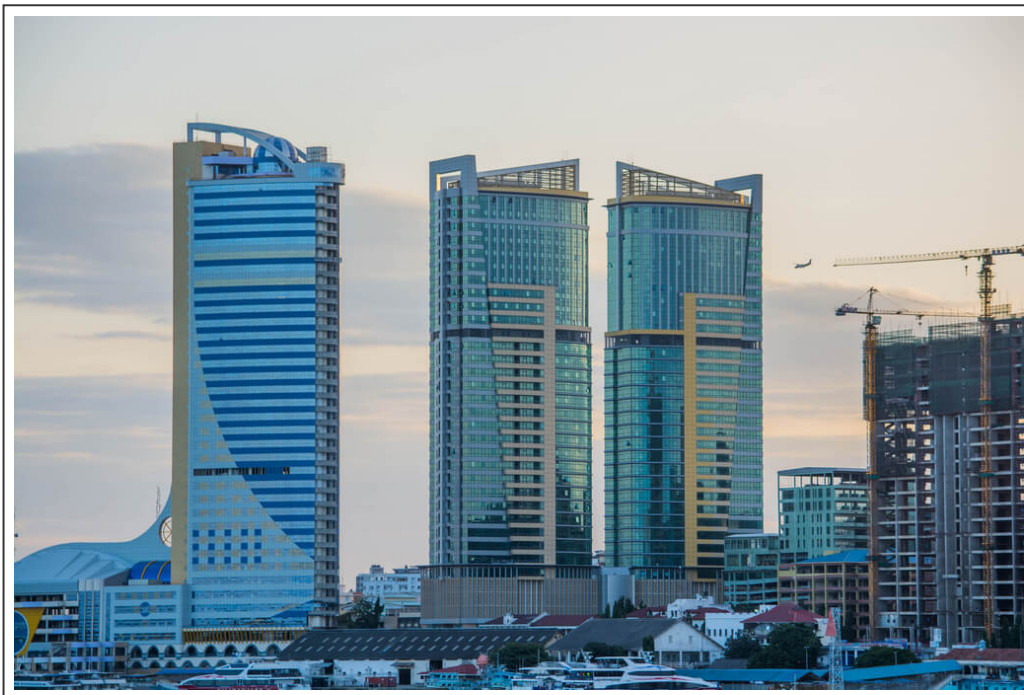
Dar Es Salaam

Dar Es Salaam is the capital of Tanzania. Mandatory passage for international airliners. It is the main port on the Indian Ocean. The city has 4 million inhabitants (in 2006) . Nevertheless, Tanzania's administrative capital remains Dodoma , located 440km further west.