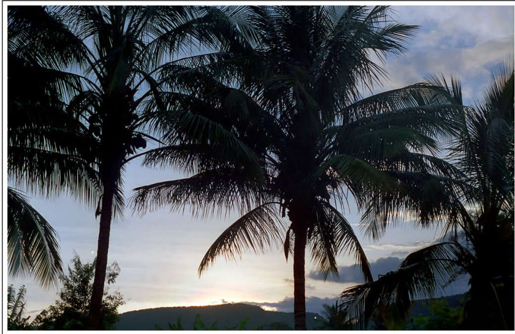
Sunrise on the Ngorongoro

The Ngorongoro Crater has been a UNESCO World Heritage Site since 1979 . It is located southeast of the Serengeti Park and measures over 22km in diameter. After the Serengeti, visiting the crater is the most popular safari for tourists. The place is simply magical.