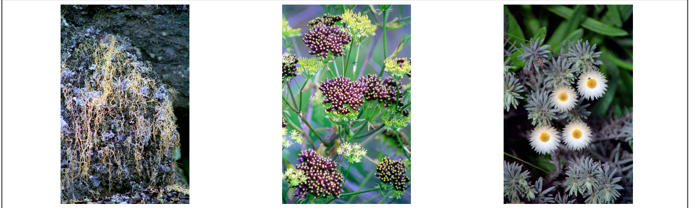
Flowers on the way