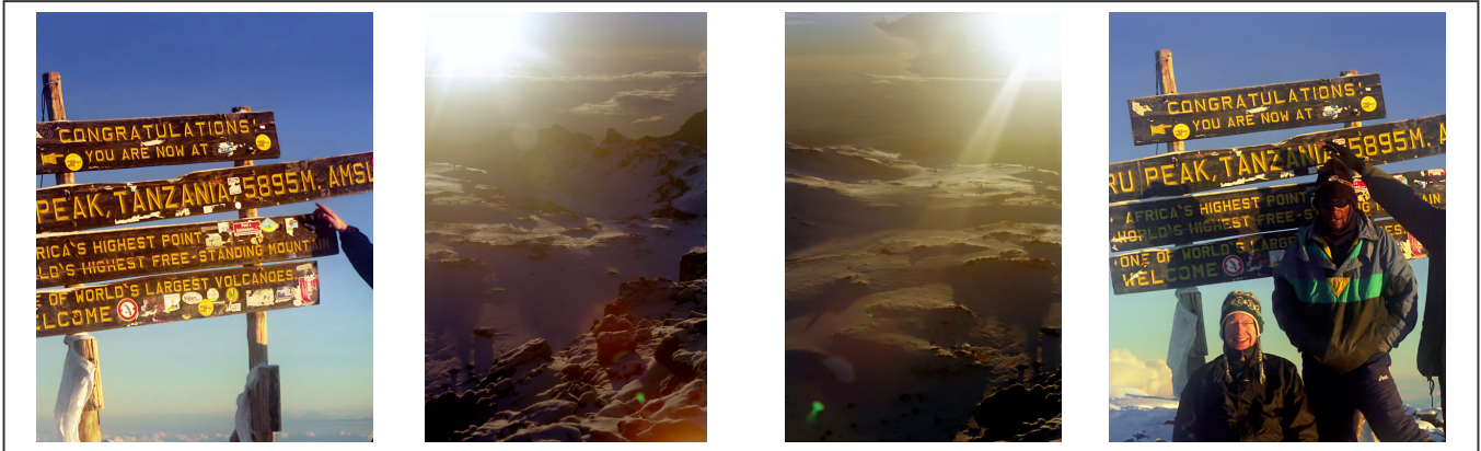
The top of Kilimanjaro