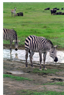
Wildlife in the Ngorongoro Crater