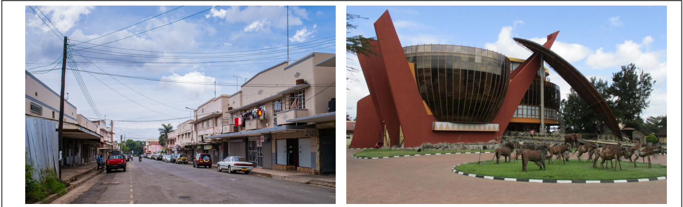
Cultural center and typical street of Arusha

Arusha is located 620km from the capital, Dar es Salaam . It is the largest city in the region with a population of over 400,000 citizens . It is very close to major tourist points of interest, such as Mount Meru, Mount Kilimanjaro, Serengeti Park and Ngorongoro Crater .