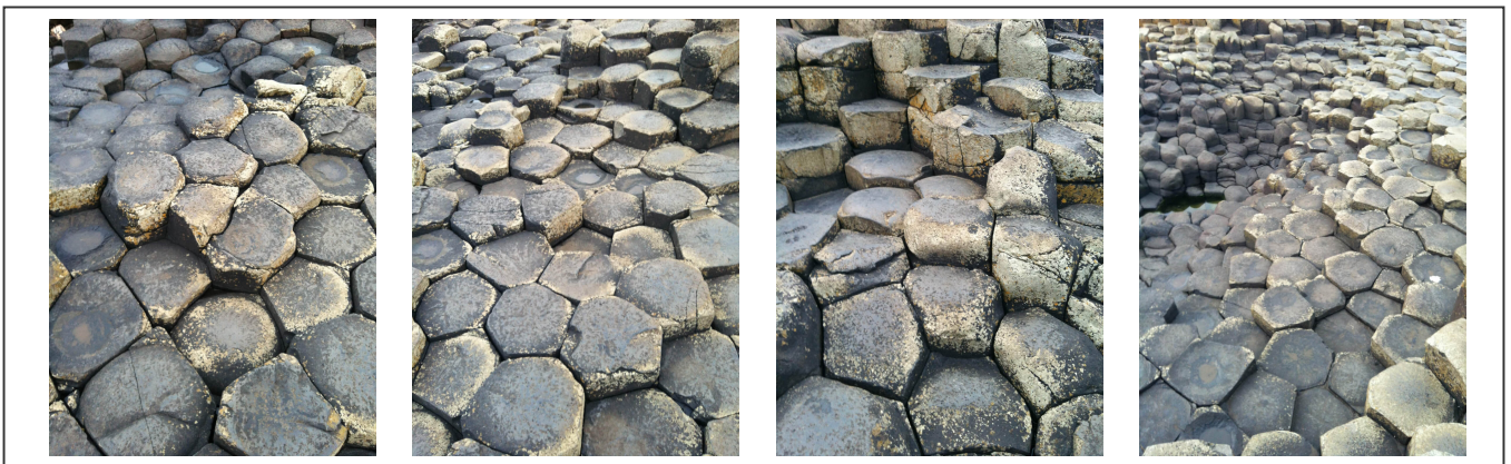
The Basalt columns of the Giant's Causeway