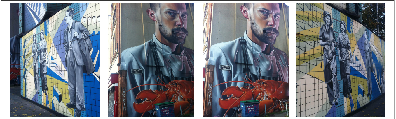
Mural paintings in the streets of Belfast