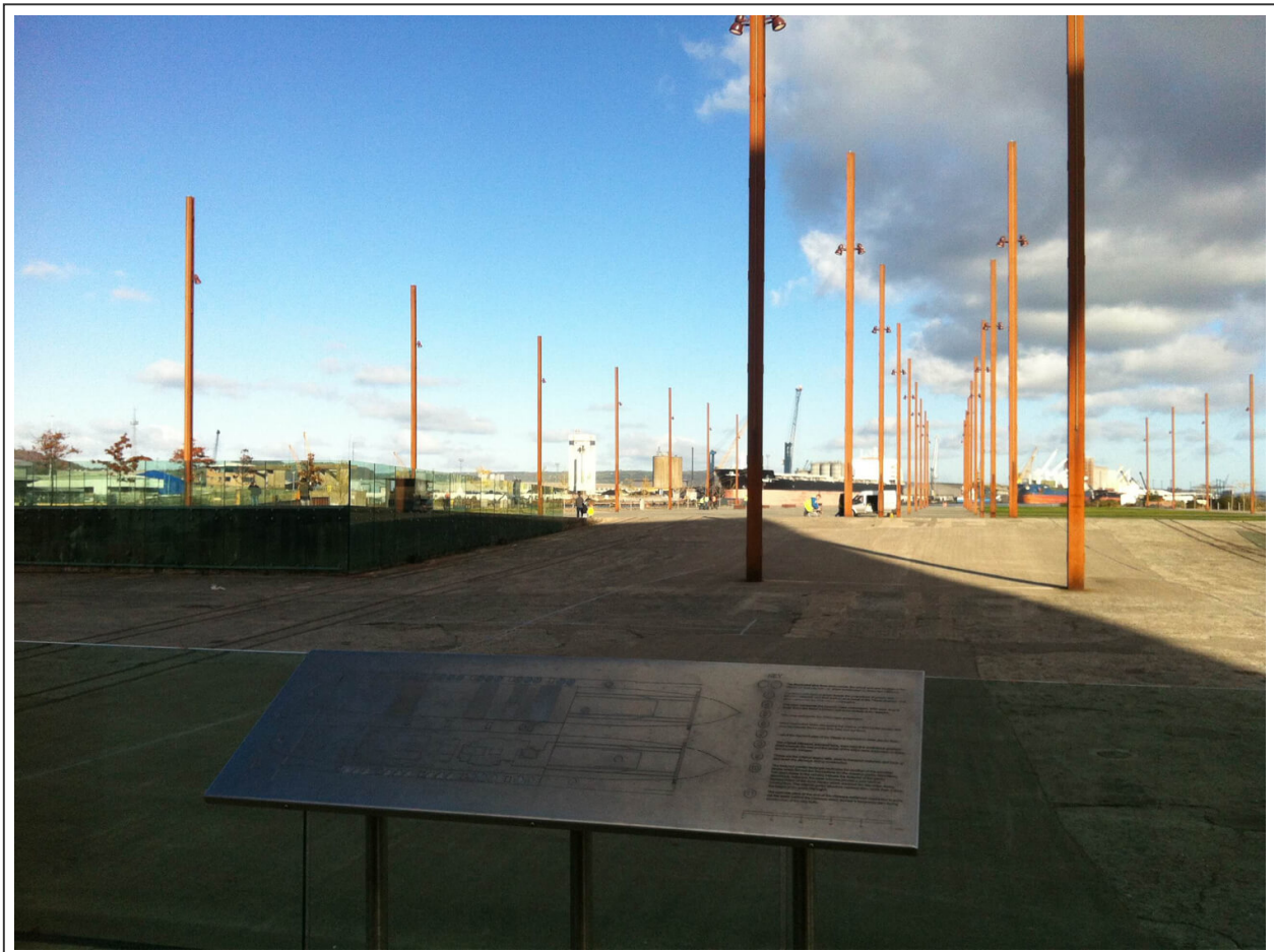
The Titanic shipyard