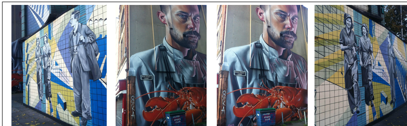
Mural paintings in the streets of Belfast