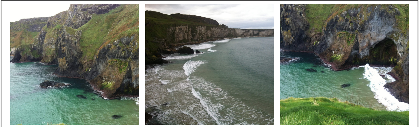
The beautiful colors of the coastal region

The north of Ireland is often the setting for film productions. Its breathtaking coastal scenery is certainly not innocent in this choice.