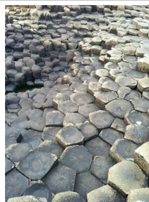
The Basalt columns of the Giant's Causeway