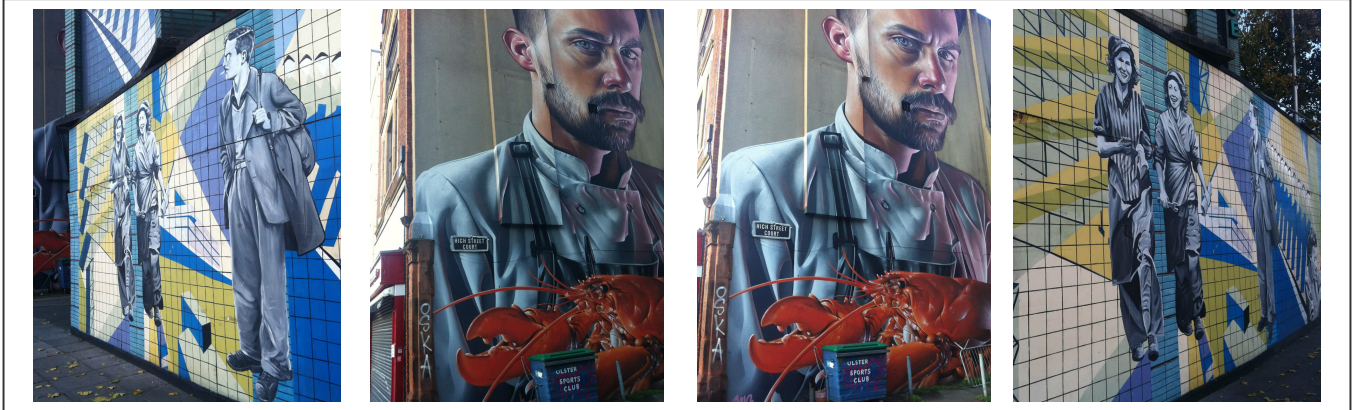
Mural paintings in the streets of Belfast