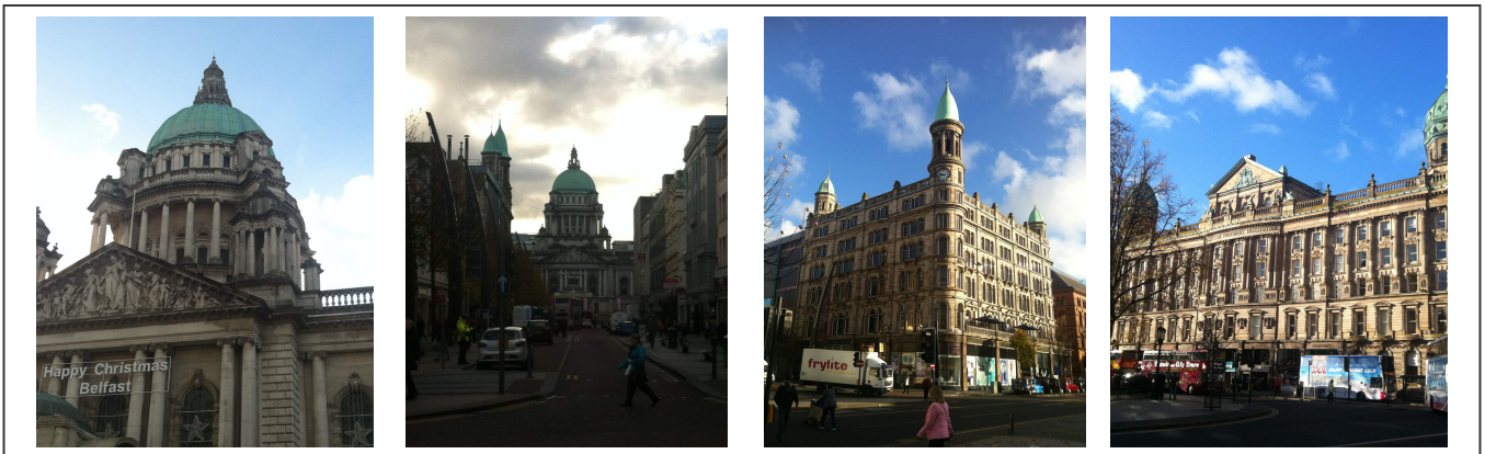
The Belfast Parliament

The city of Belfast is very well known for its shipyard. It was in this city that the Titanic was designed and then sank in 1912 during its first journey. The city has dedicated a magnificent interactive museum to the ship, which is well worth a visit. It is easy to spend half a day there.