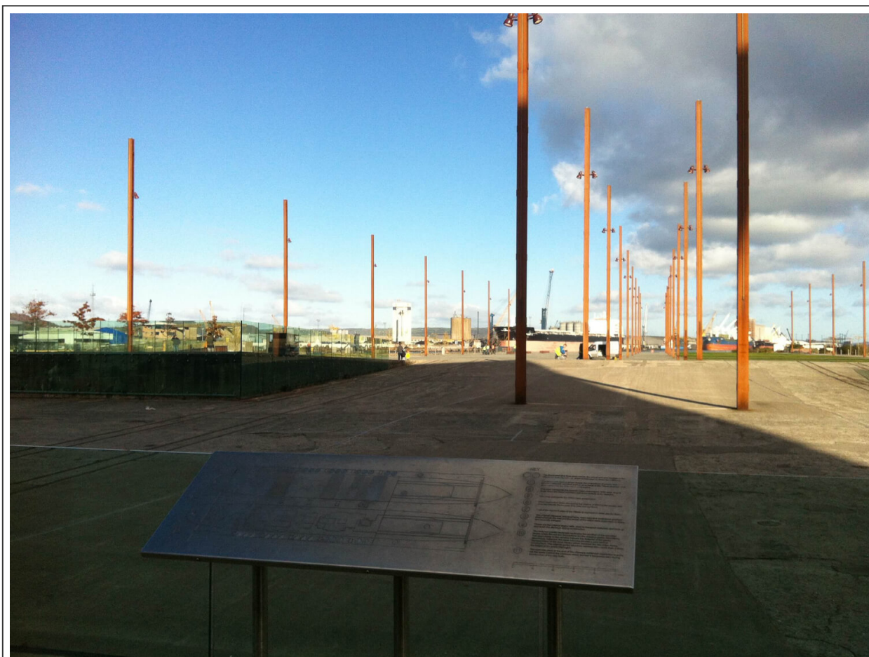
The Titanic shipyard