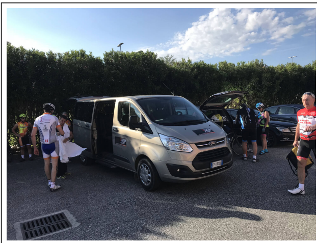
Thanks to ...

Departure from Volterra and return to civilization, if we could say so, so much the contrast between the old high city is striking in terms of traffic and noise. Especially around Pisa , it is infernal. Nevertheless, it had to stop one day. Tuscany is really a corner of paradise to visit, especially by bike. As much for the landscapes, the villages crossed and the history of the big cities, Tuscany will not be forgotten so soon.