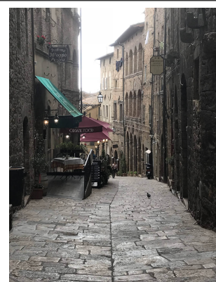
The streets of Volterra