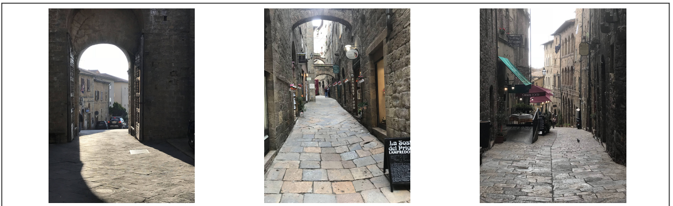
The streets of Volterra

The town, a fortified city built in the 8th century, has very thick walls. Once inside, it is a maze of alleys which offers itself to you and which really deserves a small visit.