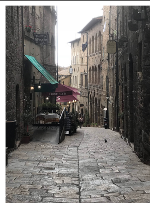
The streets of Volterra