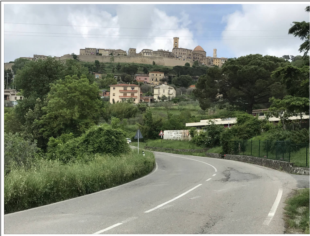
The city of Volterra