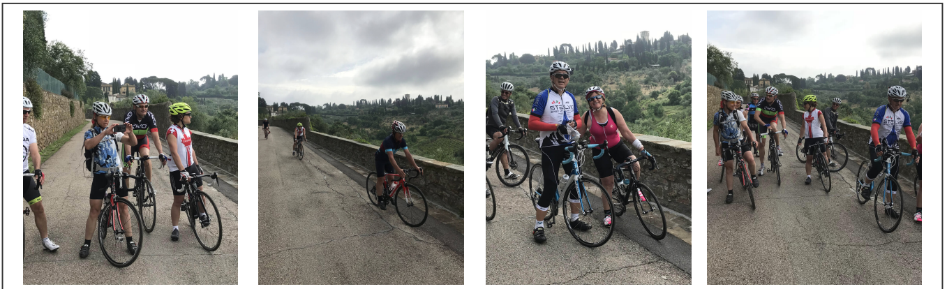
In the neighbourhood of Florence

Another quiet day. The departure from Florence is simply grandiose. A road on the ramparts, not authorized to motor vehicles, allows to stop and photograph the surrounding landscape.