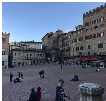
Siena and its central square