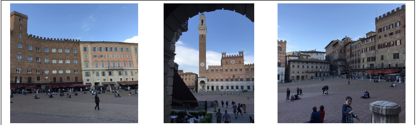
Siena and its central square

Siena or Sienna in Italian, is a city well known for its Palio , a large square transformed twice a year into a racetrack. Tourists flock to see this spectacle. It takes place in the summer, in July and August. It is very pleasant to lose yourself in its alleys.