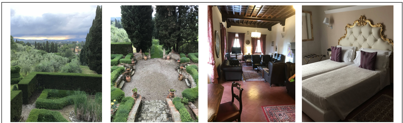
The Florence Hotel and its garden

The hotel chosen by Sport Azur, built on a hill outside the tourist town, was a real surprise for all the participants. It looks like a castle, with its garden. A real beauty.