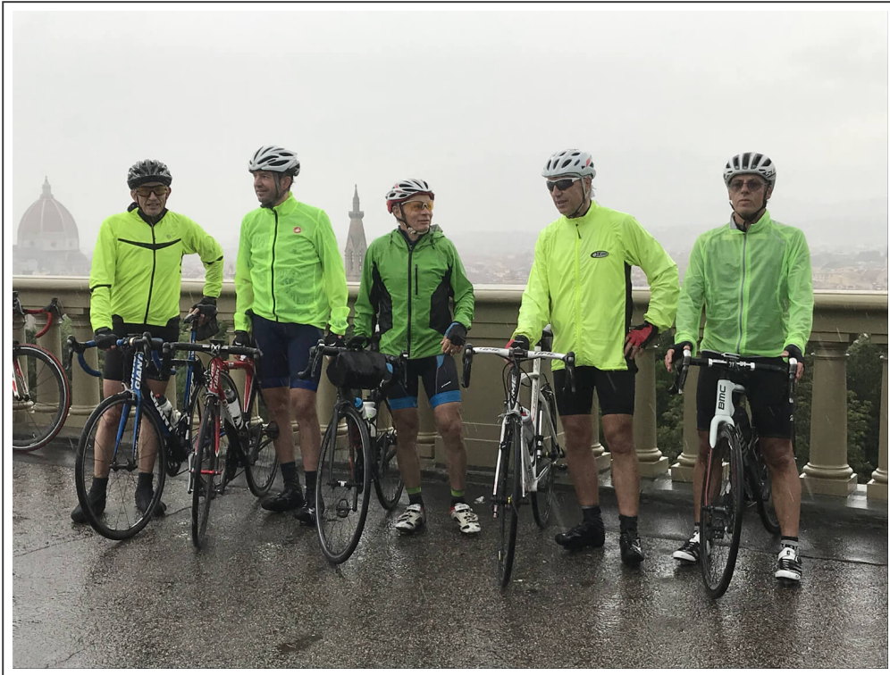
Some of the participants

Rainy day, but the good mood was radiant.