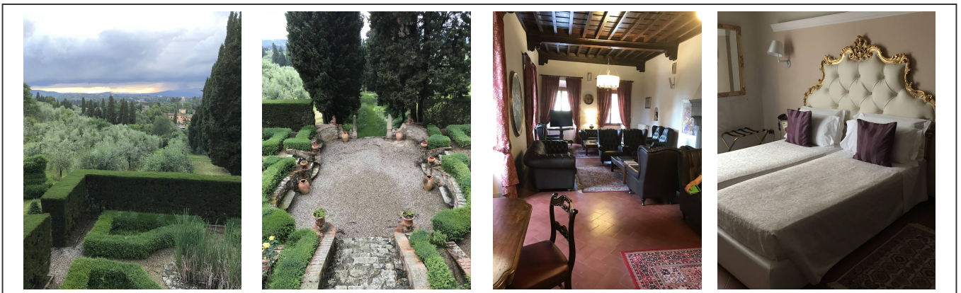
The Florence Hotel and its garden

The hotel chosen by Sport Azur, built on a hill outside the tourist town, was a real surprise for all the participants. It looks like a castle, with its garden. A real beauty.