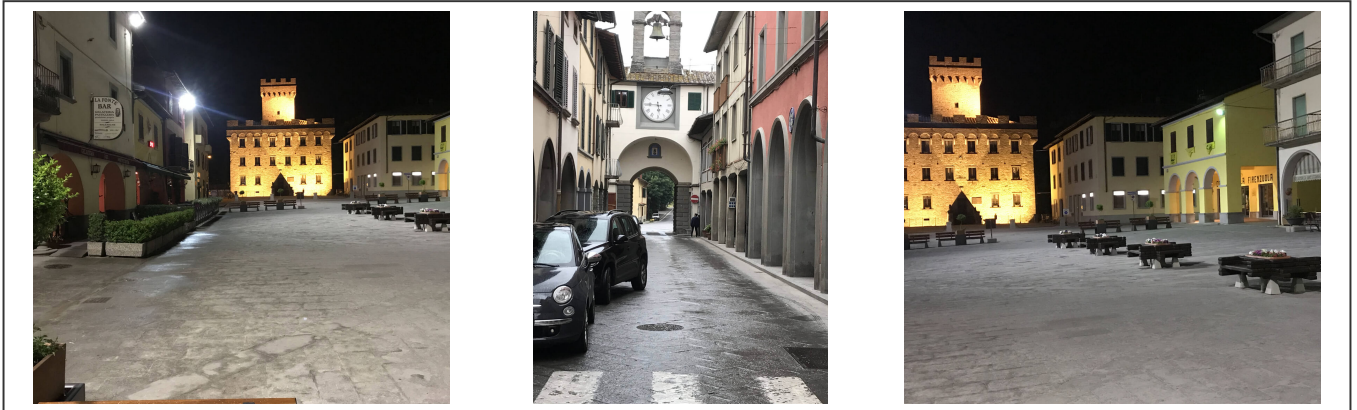
Street and central square of Firenzuola

Firenzuola is a very small town, located 40km from Florence . It does not lack charm. Its central square and narrow streets have kept their medieval character. There are plenty of stores under the arcades, as well as restaurants and bars, most of which have terraces.