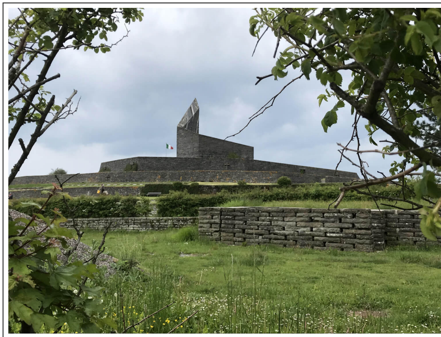
Military monument at the exit of Pievepelago

This course is mountainous, to say one thing. 137km long, the bumps follow one another at a frantic pace. At the end of the day, the impression of having climbed a pass is not usurped, so difficult is the course.