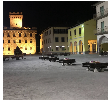
Street and central square of Firenzuola