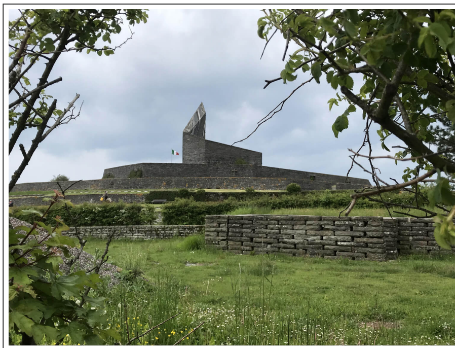
Military monument at the exit of Pievepelago

This course is mountainous, to say one thing. 137km long, the bumps follow one another at a frantic pace. At the end of the day, the impression of having climbed a pass is not usurped, so difficult is the course.