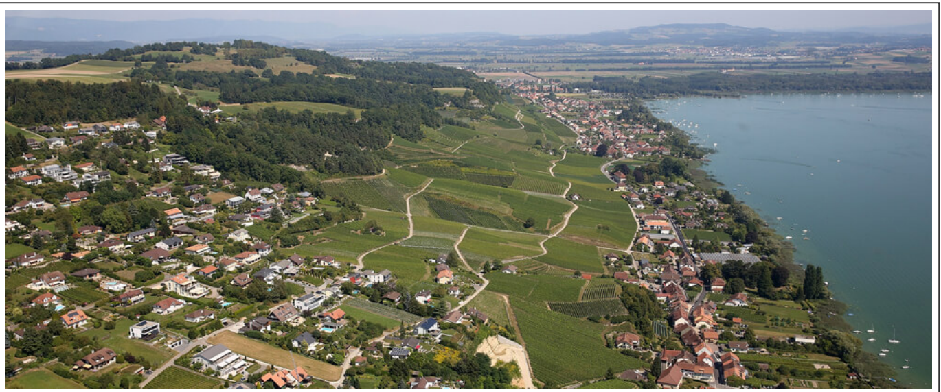
Municipality of Mont-Vully and Lake of Morat

Once the industrial zone of Avenches is free, the first contact with the lake shore is in Faoug . Then we pass by Courgevaux , Morat , Galmiz , before reaching Sugiez .