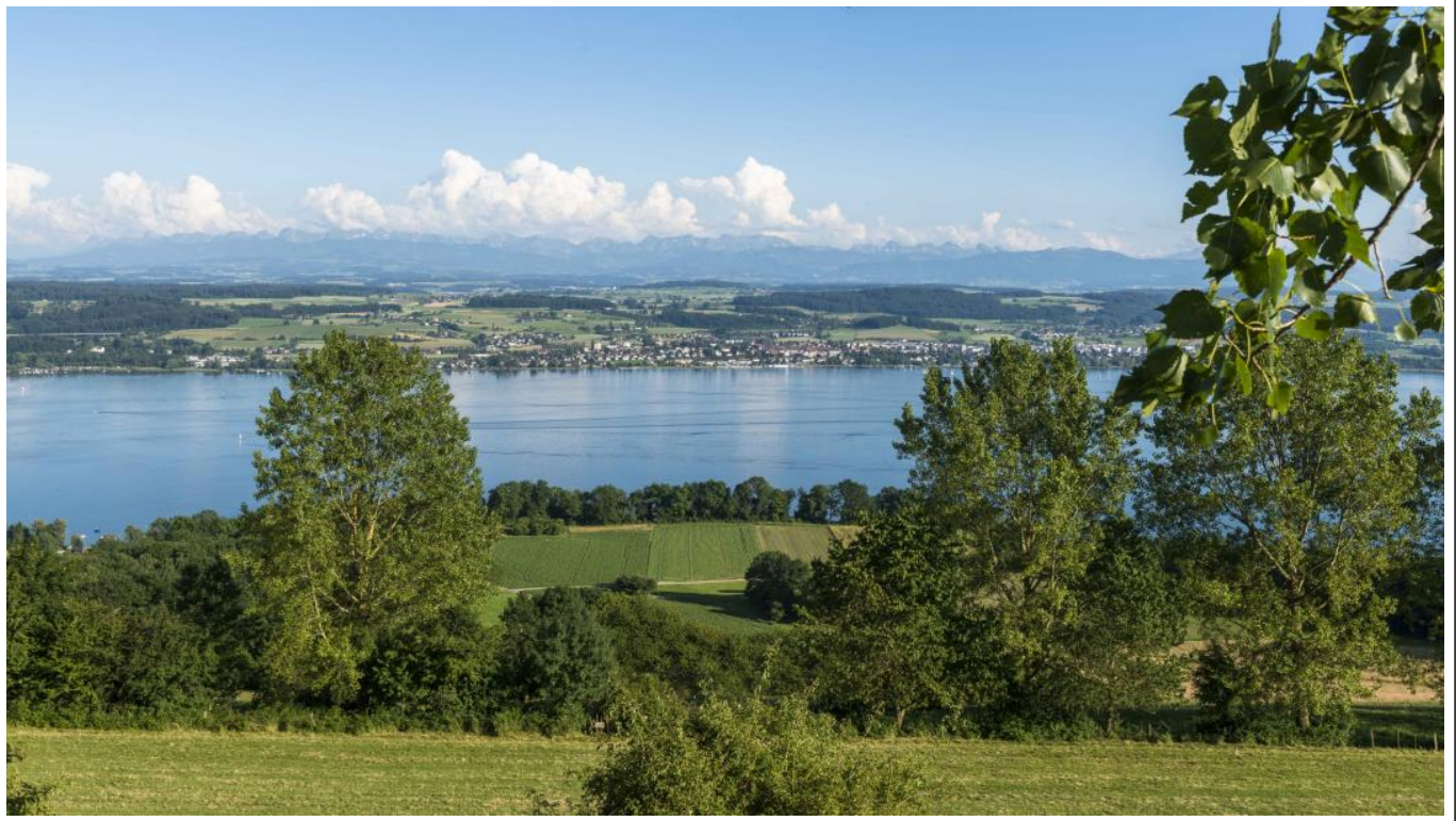
Lake of Morat

The only difficulty of the course is the climb in the vicinity of Sugiez . The climb is not long, but steep.