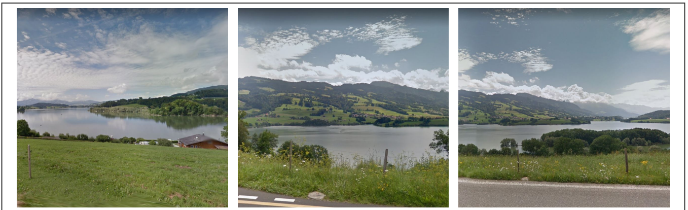
The north shore of the lake of Gruyère

Passing through Broc , the road winds its way along a small path to avoid the city center and the chocolate factory. A little further on, it crosses the Sarine on a narrow bridge before reaching Morlon , Echarlens , Vuippens .