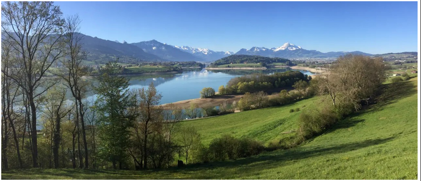
View from the Vignier restaurant at the Cantine

In Vuippens , the traffic becomes heavier and the route crosses the main road. The slope up to the Cantine is pleasant and the view on the lake on the right is simply magnificent. If you have time, consider stopping at the Vignier restaurant for a drink. The view is simply breathtaking.