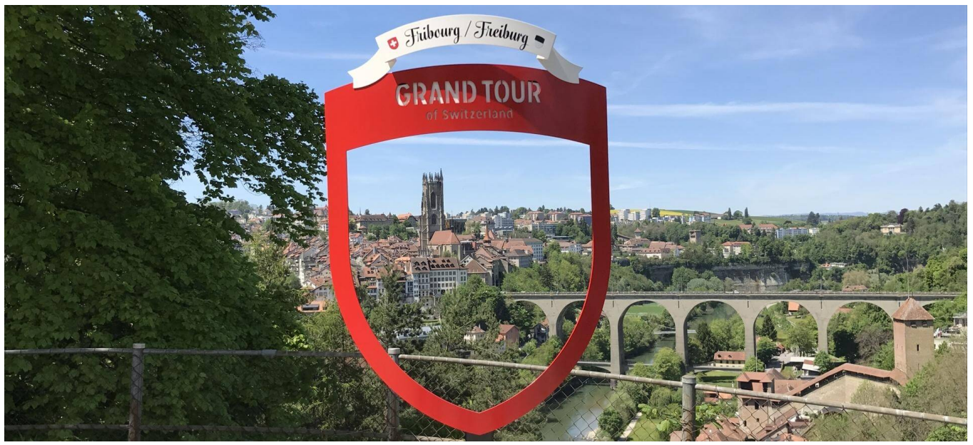
View from the Gottéron bridge, Fribourg