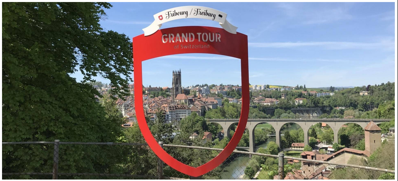
View from the Gottéron bridge, Fribourg