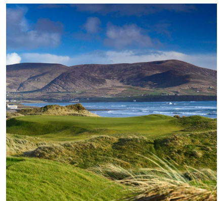
Waterville on the ring of Kerry