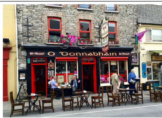
Streets and pubs of Kenmare

End of this 8th stage, quite tiring, especially because of the wind. But Kenmare, with its numerous pubs, opens us the appetite. Really welcoming city that I advise you to visit.