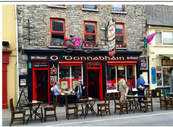
Streets and pubs of Kenmare

End of this 8th stage, quite tiring, especially because of the wind. But Kenmare, with its numerous pubs, opens us the appetite. Really welcoming city that I advise you to visit.