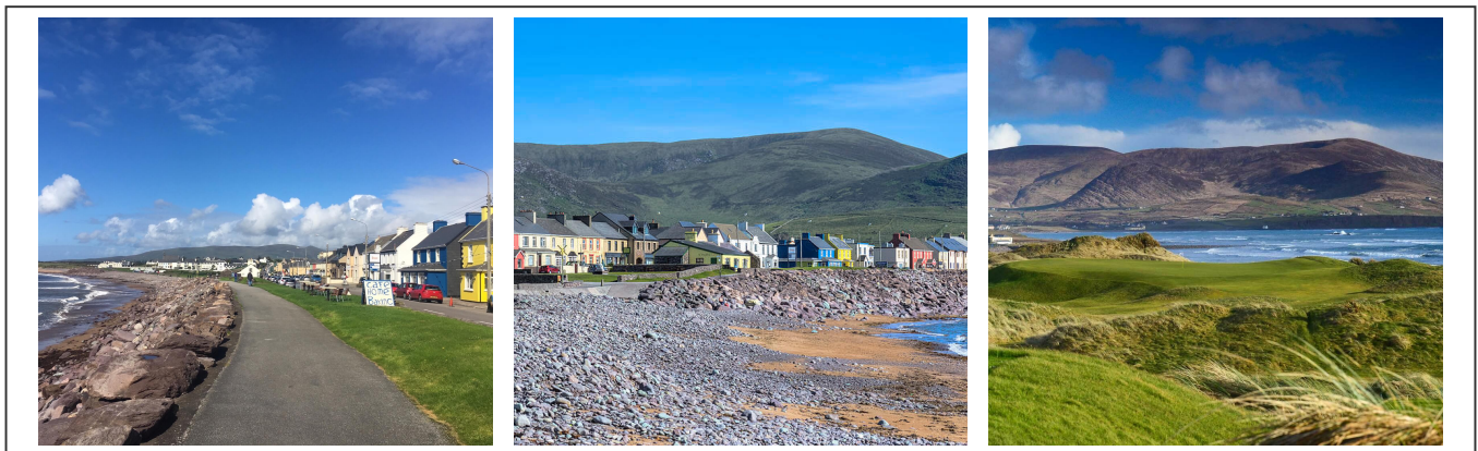
Waterville on the ring of Kerry

From Tralee, I could have chosen to go for a loop in Dingle County and the town of the same name, but time was running out, so I preferred to go straight down south to Killorglin and join the coast via Waterville , before reaching Kenmare . The road to reach Waterville is not an easy one. It is part of the Ring of Kerry . It is perhaps the most difficult I have ever had to take. The elevation gain is not very important, but the bumps follow one after the other. Nevertheless, it's really worth it to take a look at the coastal road.