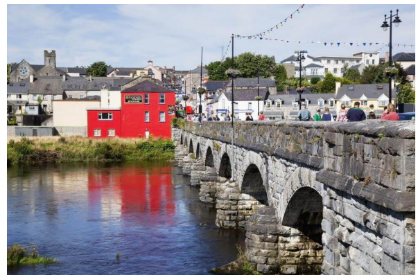
Tralee and Killorglin

The last 25 kilometers are felt. It was a sporty day. Very happy to reach the goal set, Killorglin , first town on the Ring of Kerry .