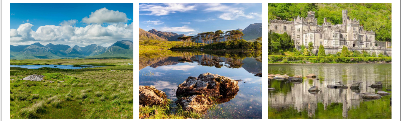
The lakes of Connemara and Kylemore Abbey