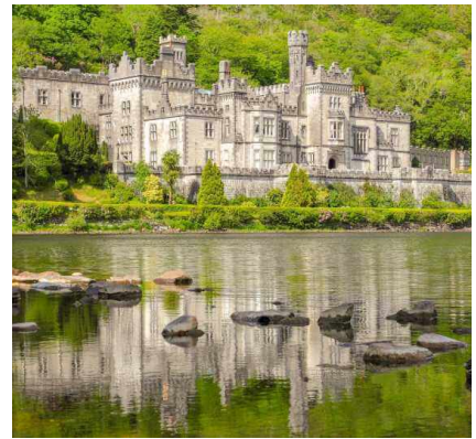
The lakes of Connemara and Kylemore Abbey