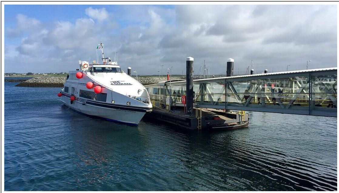
The ferry to Inishmore Island

We leave again on the saddle to cross the villages of Ballinaboy, Cashel, Gortmore, Costelloe and Rossaveel . The difference in altitude is almost flat and with the wind in the back, the 70km which separate Clifden from Rossaveel are done at an average of more than 30km/h. In less than 2 hours, I reached the port of Rossaveel, from where the ferries leave for the Aran Islands and more particularly the one I was interested in, Inishmore .