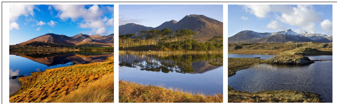
The lakes of Connemara

From Louisburgh, the road climbs gently but surely. In fact, it will be jagged all day long. After skirting Killary Harbour Lake, the first stop was in the village of Leenane . This is where the Connemara region really begins. The road going down to Clifden is really out of time.