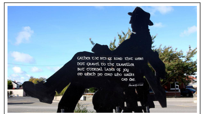
Irish poet Patrick Kavanagh

It is the village of the poet Patrick Kavanagh (1904-1967) . He composed many texts and songs of the Irish tradition. There is a museum in his name, but I have not visited it.