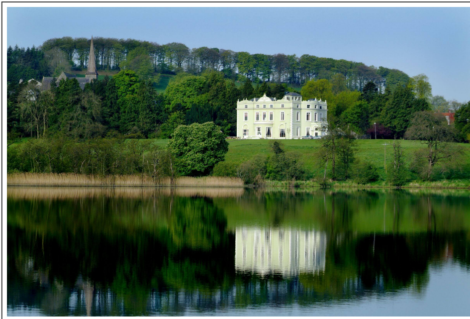
The Castleblayney's castle