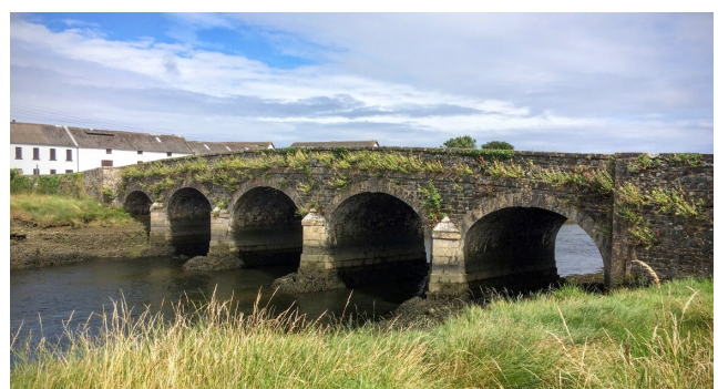
Direction Annagassan by the coastal road