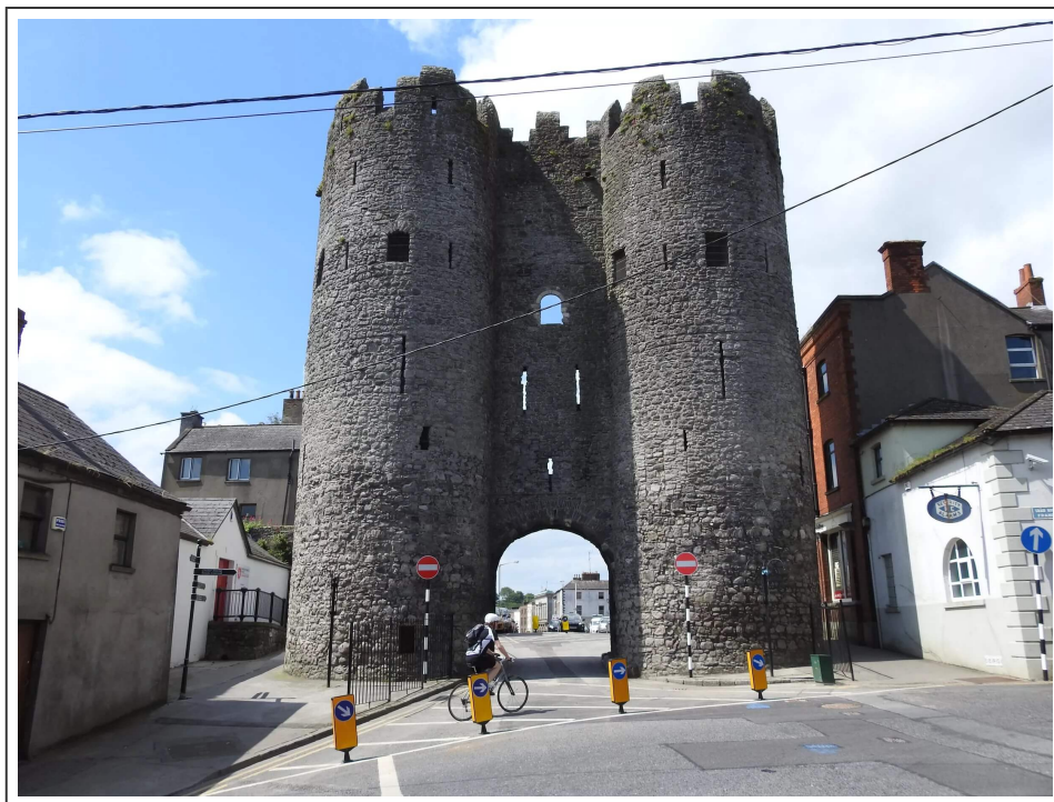
Drogheda's front door

County Louth is the smallest county in Ireland. Its proximity to Dublin makes it an area where commuters live. It is a quiet region. Drogheda is located less than 50km from Dublin, via the freeway. Originally, it is a stronghold, surrounded by the River Boyne . It has an imposing cathedral, many pubs and restaurants and is a good place for bicycle tourists.