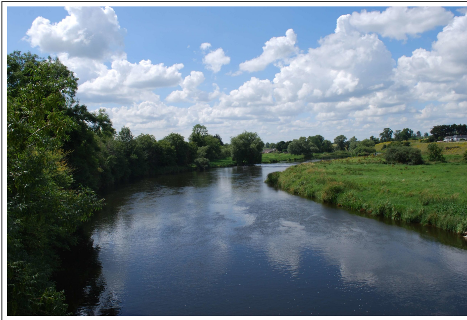
The Boyne River