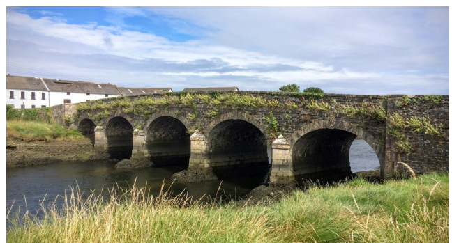
Direction Annagassan by the coastal road