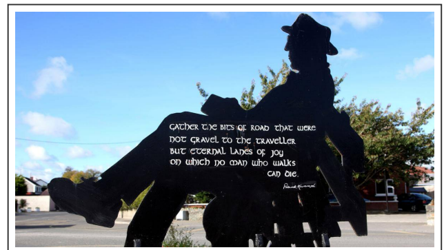
Irish poet Patrick Kavanagh

It is the village of the poet Patrick Kavanagh (1904-1967) . He composed many texts and songs of the Irish tradition. There is a museum in his name, but I have not visited it.