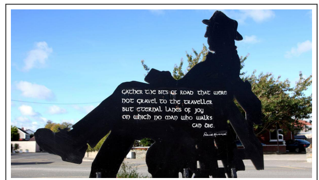
Irish poet Patrick Kavanagh

It is the village of the poet Patrick Kavanagh (1904-1967) . He composed many texts and songs of the Irish tradition. There is a museum in his name, but I have not visited it.