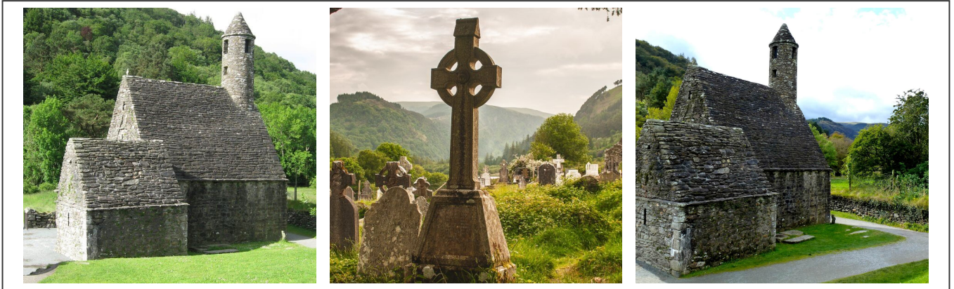
Glendalough Cemetery and Chapel