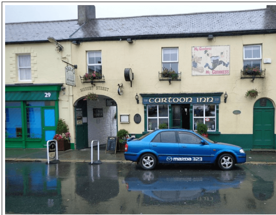
Rathrum Cartoon Inn

I stop for coffee at the Cartoon Inn, and ... I never left. That's what cycling is all about. You have to know how to say stop when the weather lets you down. I had originally planned to complete this tour of Ireland in 12 days, but I'll end up doing it in 14 days.