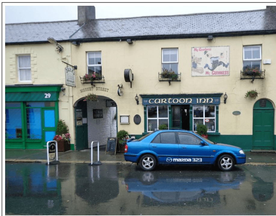
Rathrum Cartoon Inn

I stop for coffee at the Cartoon Inn, and ... I never left. That's what cycling is all about. You have to know how to say stop when the weather lets you down. I had originally planned to complete this tour of Ireland in 12 days, but I'll end up doing it in 14 days.