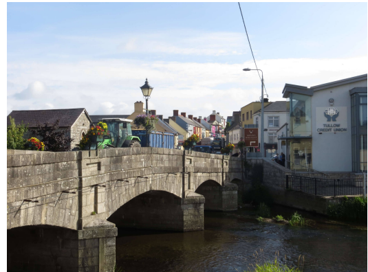
The village of Tullow and the ruins of Clonmore Castle

Tinahely has less than 1000 souls and yet it feels like a small town. The center of the village is lively and the inhabitants share the few terraces. I have rarely seen so many shopkeepers for such a small village. The river Derry flows not far away.