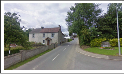
The road to Old Leighlin

The road continues for almost 50km towards Old Leighlin , we pass under the freeway bridge before reaching the Leighlinbridge , which we cross to admire its castle.