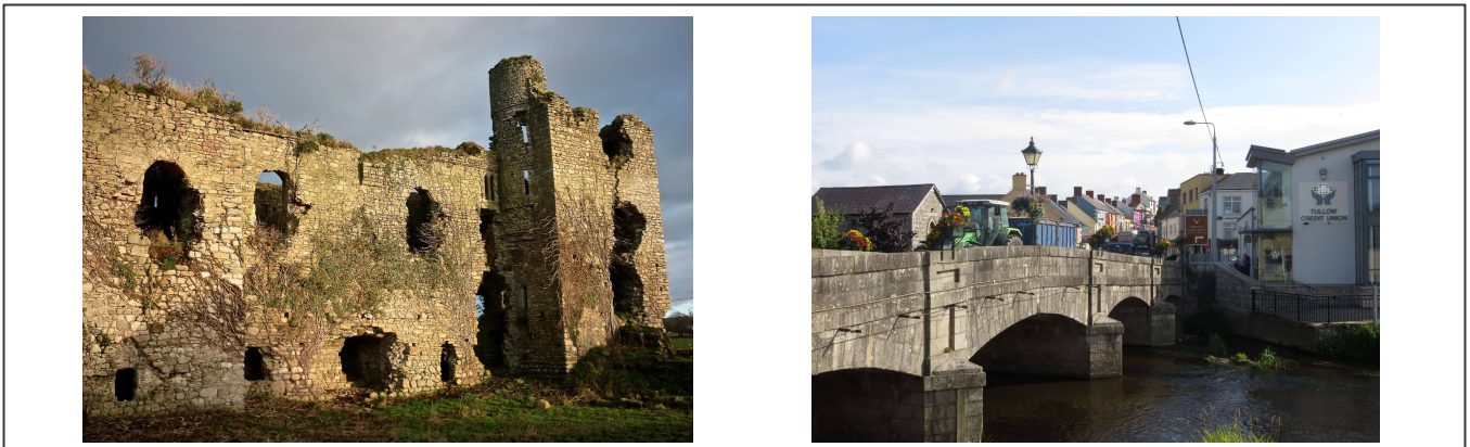
The village of Tullow and the ruins of Clonmore Castle

Further on, we pass through the village of Tullow , then past the ruins of Clonmore Castle before descending to Tinahely , the first village in County Wicklow, a hiker's paradise and the goal of our stage of the day.