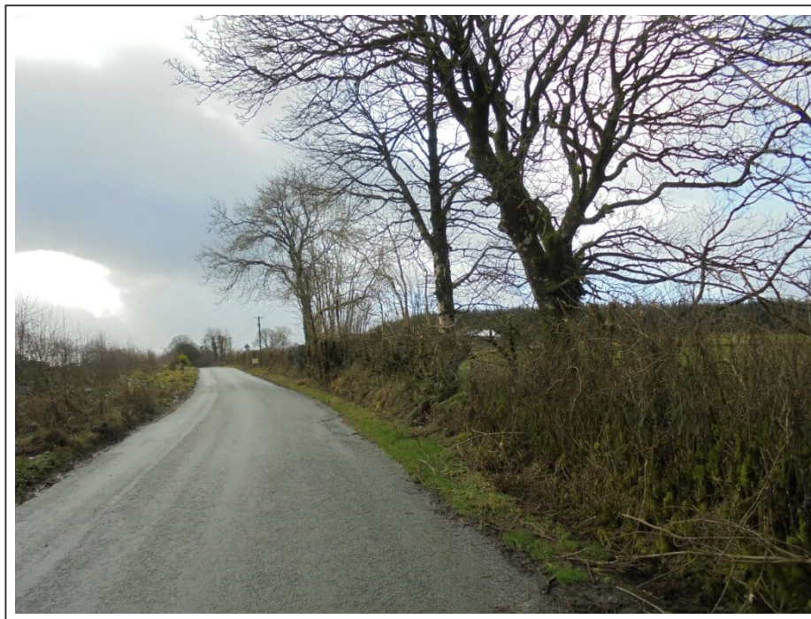
The road to Castlewarren

The road will take us through the village of Castlewarren , then we leave Killkenny County to drive into Carlow County.