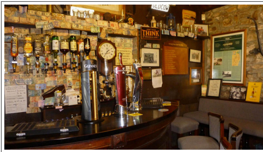
The Dying Cow Pub, Tinahely

My choice ended at the pub " The dying cow ". I love the name of the pub. I wonder if they have good steak there?