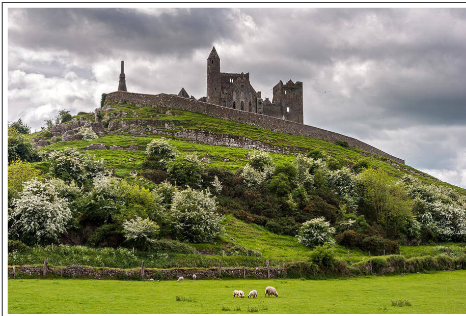
The rock of Cashel

Rather short stage today. I left Cashel only around 1pm, because of a sightseeing tour of the castle ( The rock of Cashel ). The castle is built on a green hill. It is one of the most spectacular constructions of all Ireland. A sturdy enclosure surrounds a Gothic style cathedral dating from the 13th century, as well as its keep. Moreover, in Gaelic, the name Cashel means fortress.