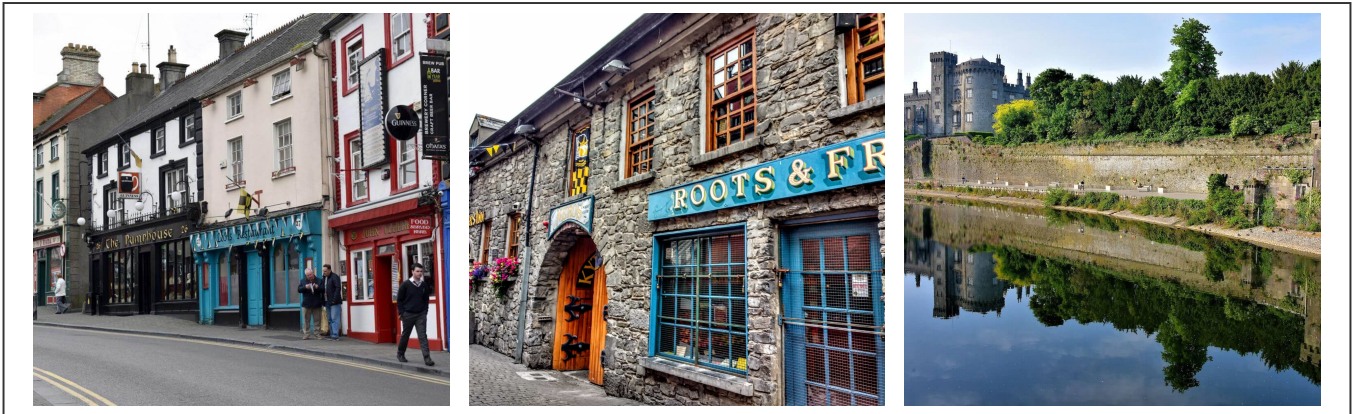
The streets of Kilkenny and its castle

The city of Kilkenny is of course internationally renowned for its beer, but it has other charming assets, starting with its castle. It was built in the 12th century. The city bears the pretty name of marble city.