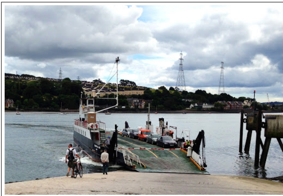
The Glenbrook Ferry

Not unhappy to leave Cork and find the quietness of the countryside. This morning, we find the bicycle path leaving Cork city center, which is a good surprise. It continues to the ferry dock at Glenbrook .