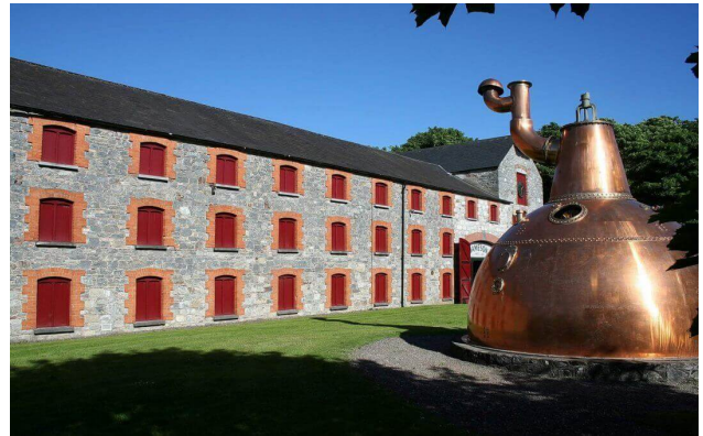
Jameson Distillery in Midleton