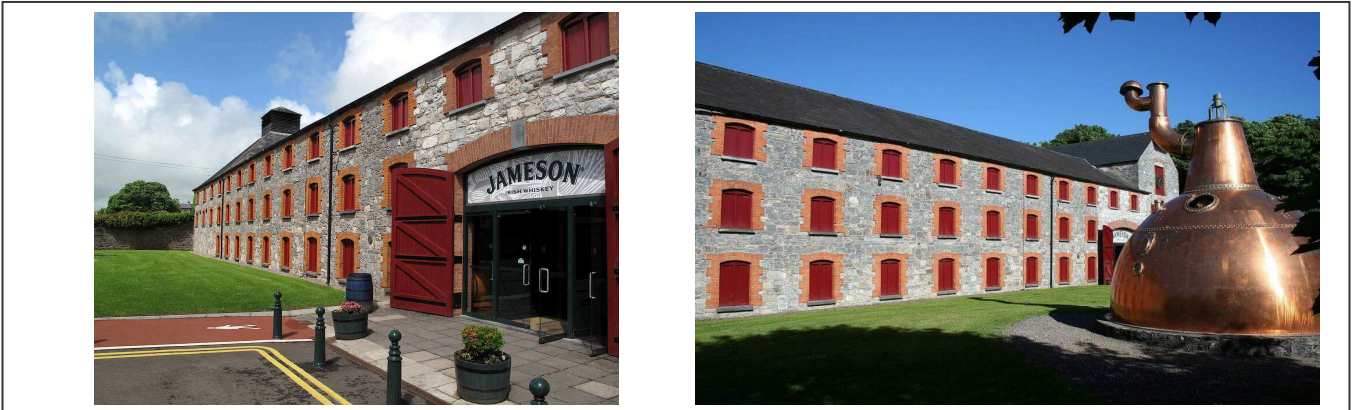
Jameson Distillery in Midleton