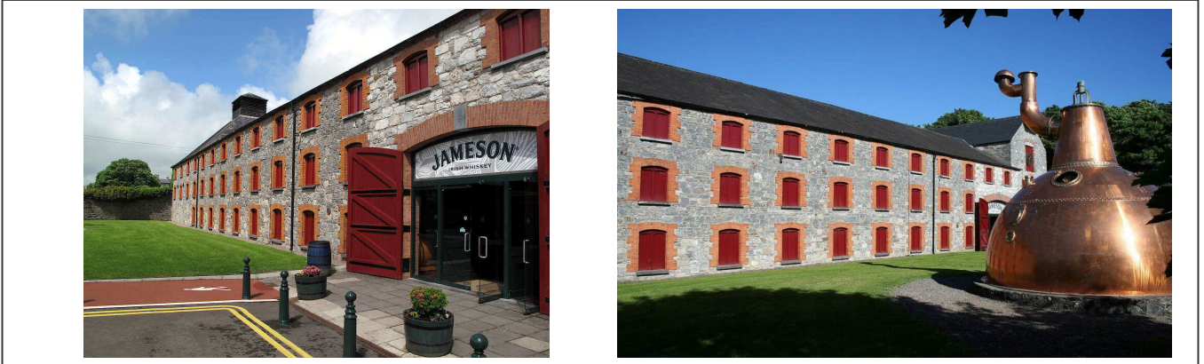
Jameson Distillery in Midleton