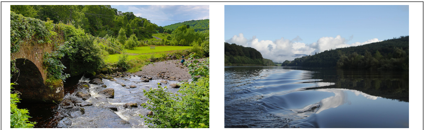
The black river, Cappoquin

The route, leaving Cappoquin , rises abruptly. The difference in altitude climbs 300m for about 10km. A good little challenge to digest the previously ingested alcohol. Nature is really beautiful here and the "Black River" is majestic.