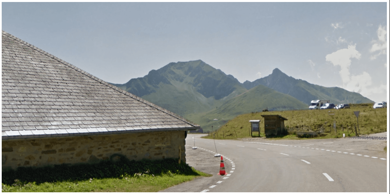
The Gürnigel pass