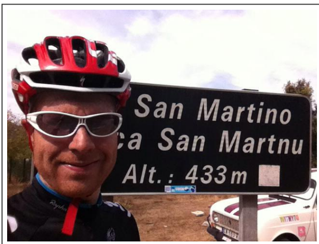
Col of San Martino

Porto is a very touristy village by the sea. It is easy to find a hotel and enjoy swimming there.