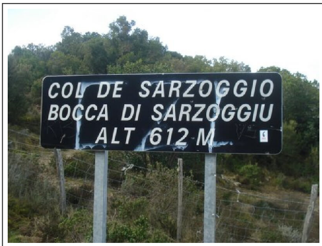
The Col of Sarzoggio

A relatively long stage of 116km to reach, first, the seaside, at the height of Propriano . Then, we follow the coastline to Porticcio . At Bastelicaccia , we take the "D303" , then the "D1" , to the col of "Sarzoggio" .