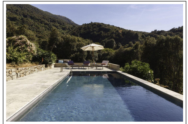
The swimming pool of the guest house "Le Ruone"

From the col, the road descends to the destination of this stage, the village of Calcatoggio . Le Ruone, just outside the village, holds a few terraced guest rooms. The pool is simply a delight after such a long day.