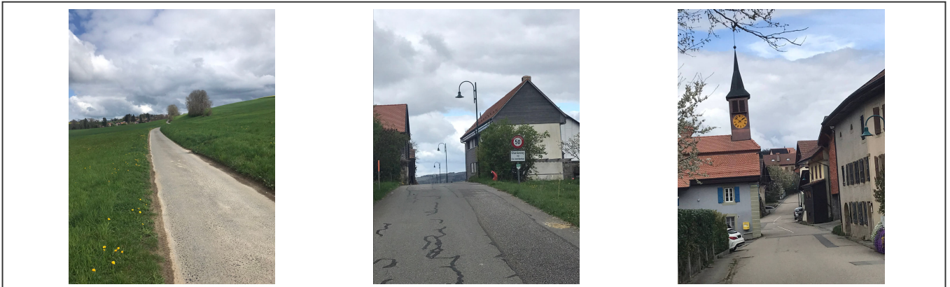
Some charming villages on the route that takes back roads

The tour passes through the villages of Villars-Tiercelin, Chapelle-sur-Moudon, Saint-Cierges, Thierrens, as far as Donneloye. The first half of this route is fairly easy, descending all the way.