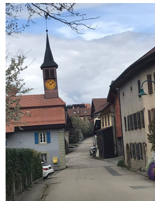
Some charming villages on the route that takes back roads