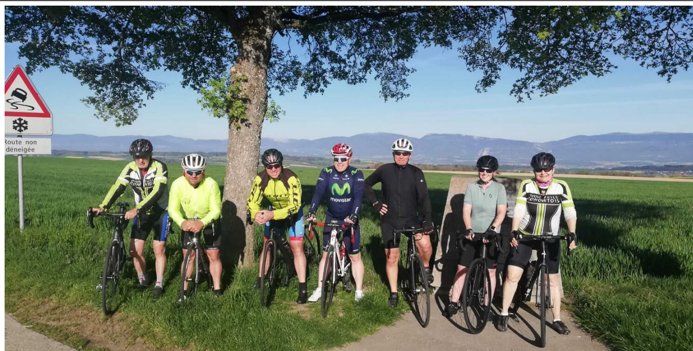
The Cyclophile romontois