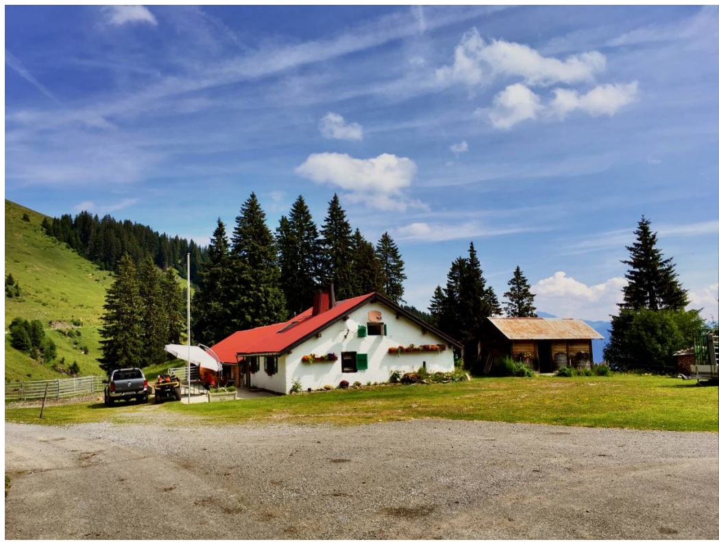
The refreshment stand of the Portes de Culet