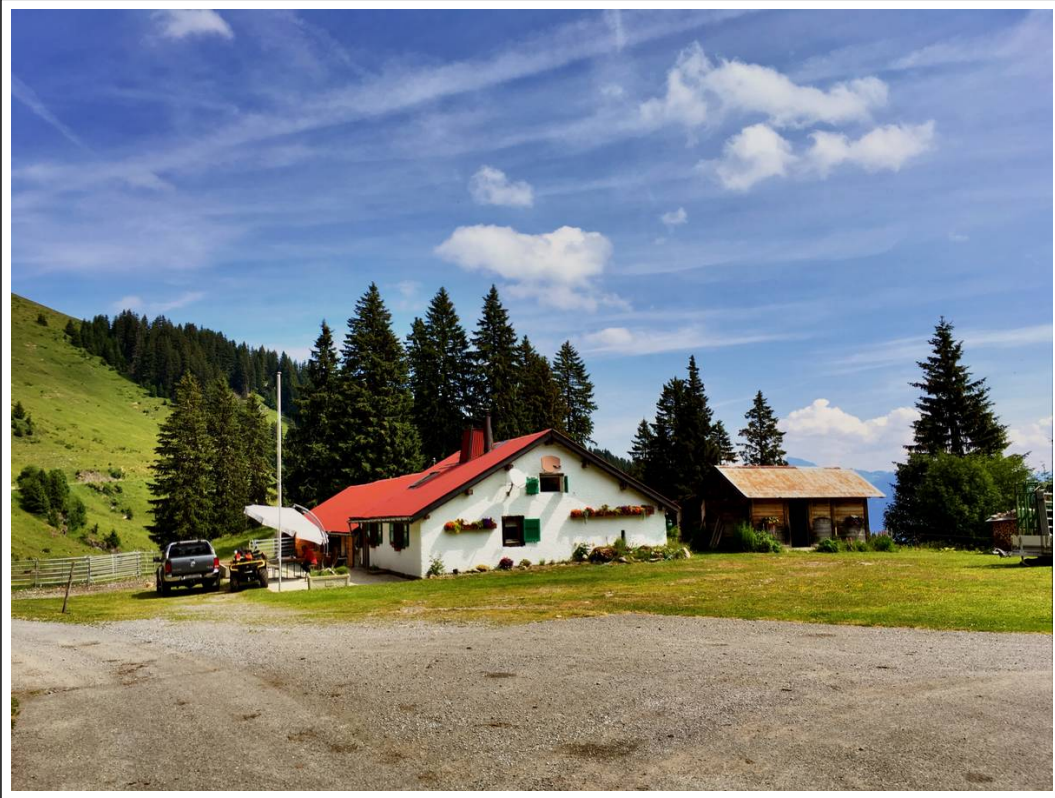
The refreshment stand of the Portes de Culet