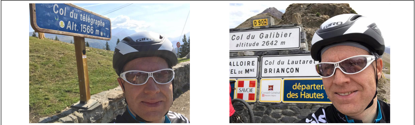
Télégraphe and Galibier Pass