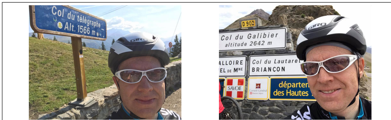
Télégraphe and Galibier Pass