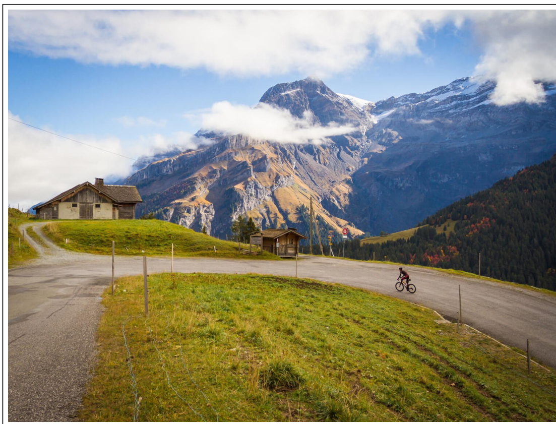
The road to the Col de la Croix

This course is a loop starting from Rennaz . The first 17 kilometers are not very difficult. It is at the exit of Bex that things get complicated. In Bévieux , turn right and follow the route des plans until Plans-sur-Bex . The road flattens out a bit and then picks up again 5km later.