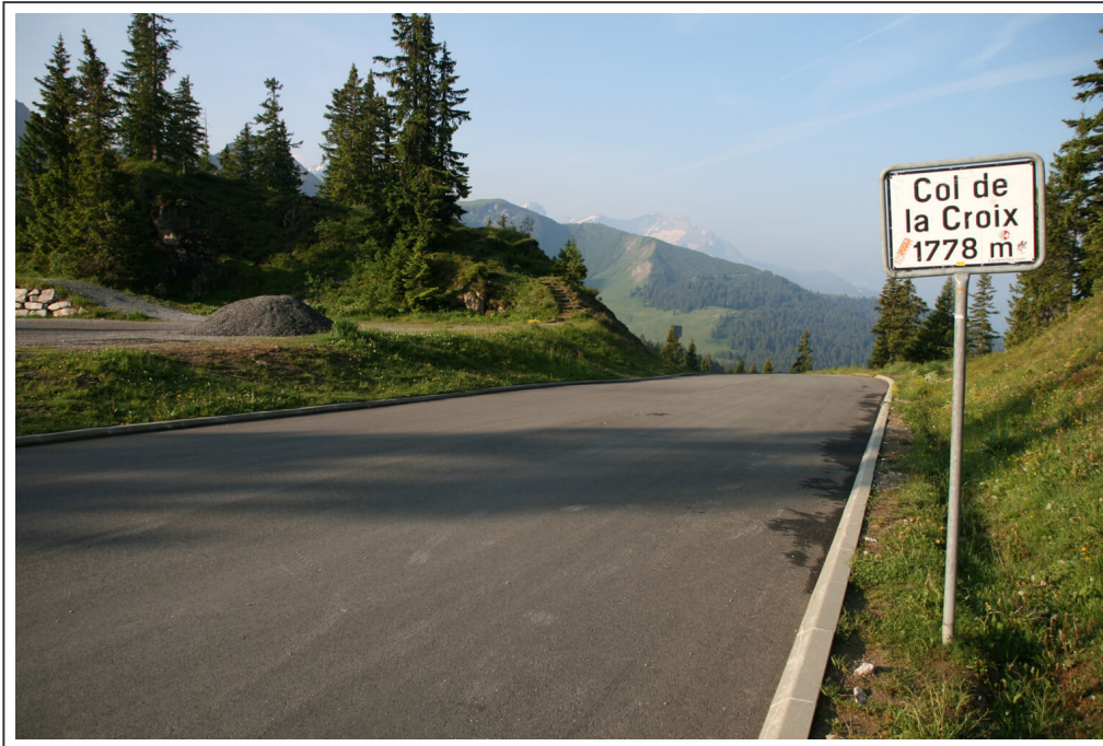
Col de la Croix

From the hamlet of La Barboleusaz , which belongs to the ski area of Villars-sur-Ollon , the slope increases again until the summit. From Villars-sur-Ollon , take the road to the Col de la Croix , for 15km.